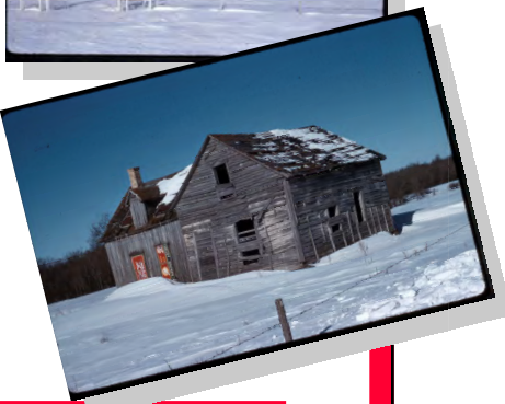
Exhibit can be viewed at: http://archives.library.yorku.ca/exhibits/show/warkentin